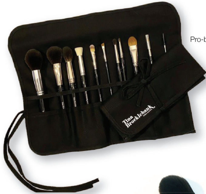
Pro-brush set with brush wrap