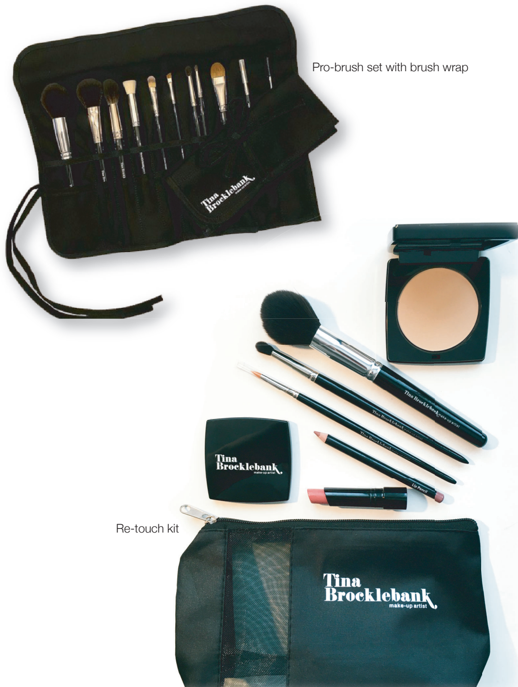
Pro-brush set with brush wrap